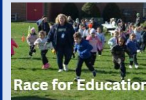
Race for Education