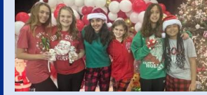
Santa's Secret Workshop