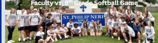
Faculty vs. 8 th Grade Softball Game