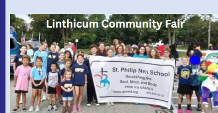
Linthicum Community Fall