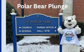
Polar Bear Plunge