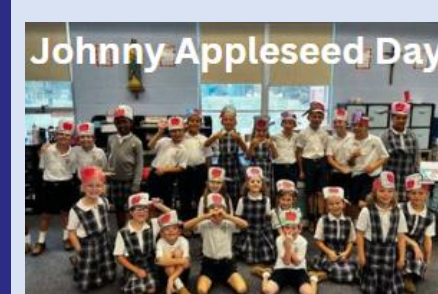
Johnny Appleseed Day