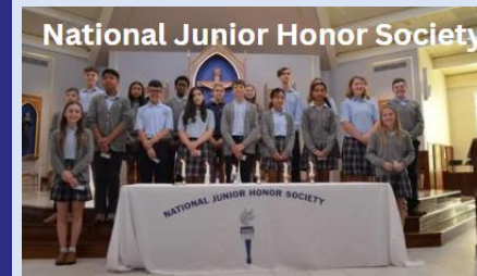
National Junior Honor Society