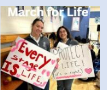
March for Life