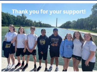
Thank you for your support!

In addition to the Annual Fund, we are grateful for the gifts to our Tuition Assistance Fund through the collection on the 2 nd Sunday of the month.