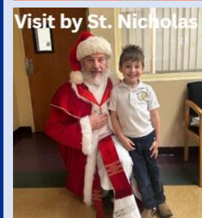
Visit by St. Nicholas