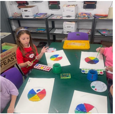
Art Room Creativity! Our Kindergarten students are working on line sculptures and our 1<sup>st</sup> and 2<sup>nd</sup> graders are learning about the color wheel as well as mixing paint to create secondary colors.