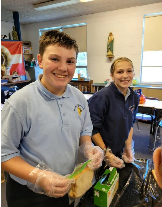
Thank you to everyone who brought in lunches for those less fortunate! Thank you to our NJHS students for bringing in supplies and making lunches!