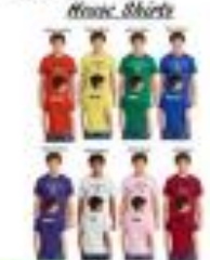
Port & Company Essential Tee Basic Shirts