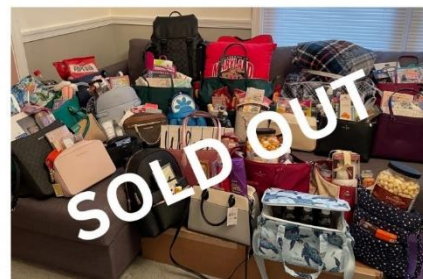
SPN Purse Bingo Saturday, January 27, 2024

School Mass at 9 AM in the church. All are welcome!