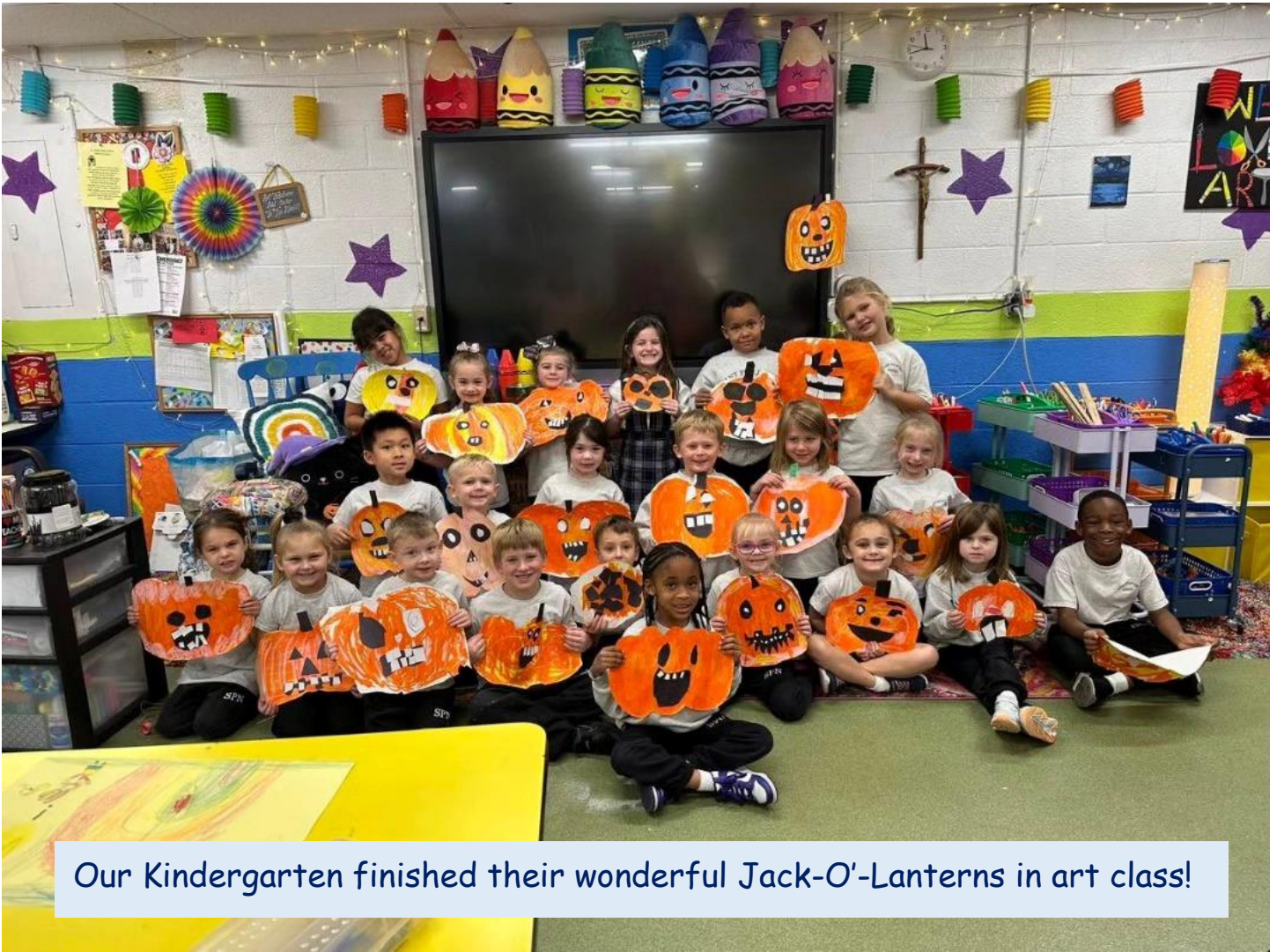
Our Kindergarten finished their wonderful Jack-O'-Lanterns in art class!