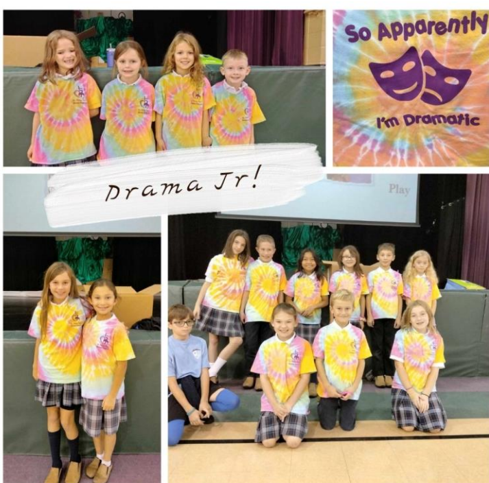
So apparently we are DRAMATIC! SPN Drama Club Jr! We are loving our new shirts!