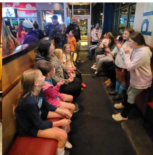
← Our U-12 girls' soccer team decided to enjoy some Glory Days after their practice!