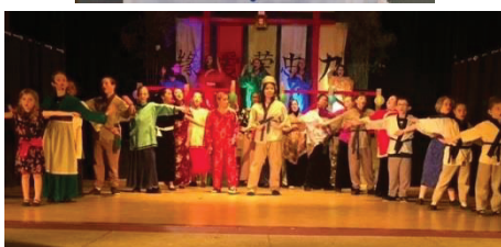
Our 2018 School Musical – Mulan, Jr.