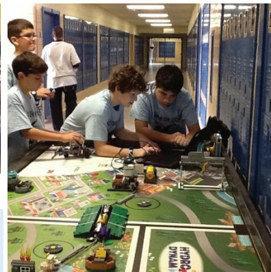
LEGO Robotics League