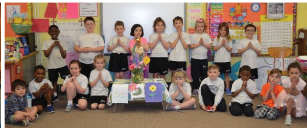
The Blessing of Mary in Kindergarten