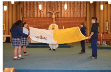
Papal Flag Ceremony