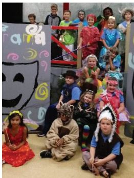
Drama Club Jr.