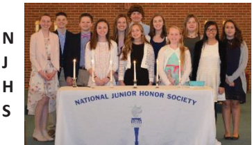
N J H S