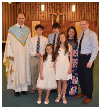
SPN School families welcomed into the church