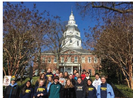
School Advocacy Day