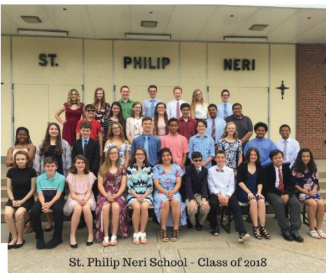
St. Philip Neri School - Class of 2018

We had several gifts made in memory of loved ones. We honor their memory by placing their names below.