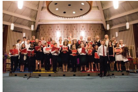
SPN School Chorus continues to grow!