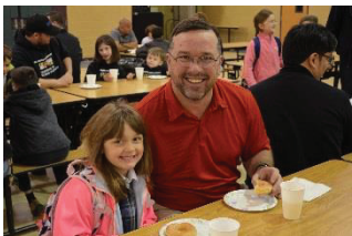
Donuts with Dad