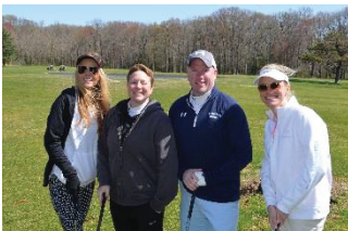
Our 1 st Annual Golf Tournament