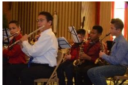
SPN Band Concert