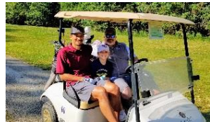
Annual Golf Tourney