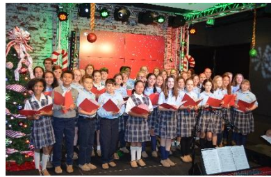
Chorus at the Radio Station