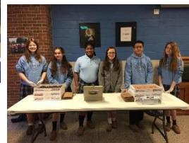
NJHS Donut Day