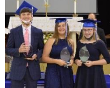
8 th Grade Graduation