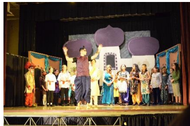
Our 2020 School Musical, Aladdin, Jr.