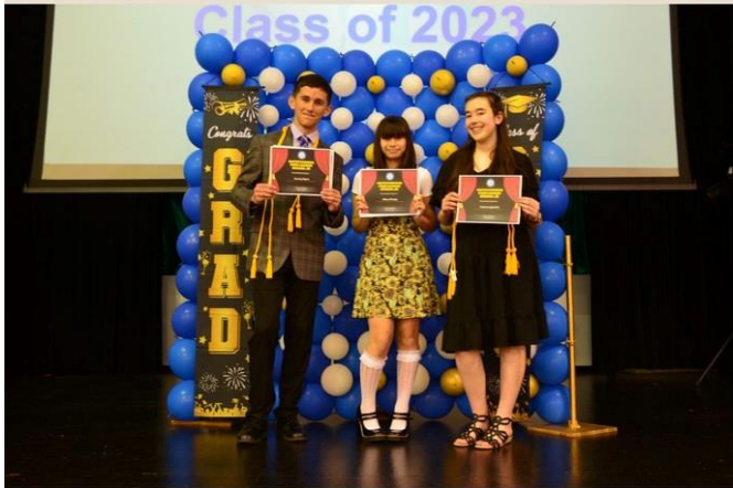
Drama Jr Peer Leaders