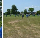
St. Philip Neri Annual FACULTY VS 8TH GRADE SOFTBALL GAME