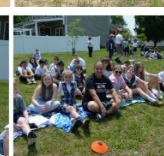
St. Philip Neri Annual FACULTY VS 8TH GRADE SOFTBALL GAME