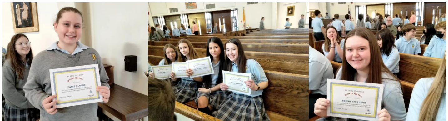
Congratulations to our middle school students who earned Principal's List or Second Honors for the first trimester! We are so proud of you! Keep up the good work!