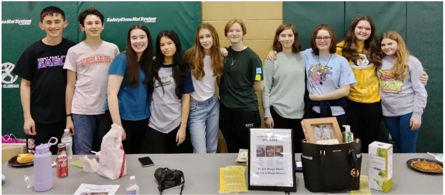
BINGO! Thank you to our NJHS students and our Alumni for helping with purse bingo!