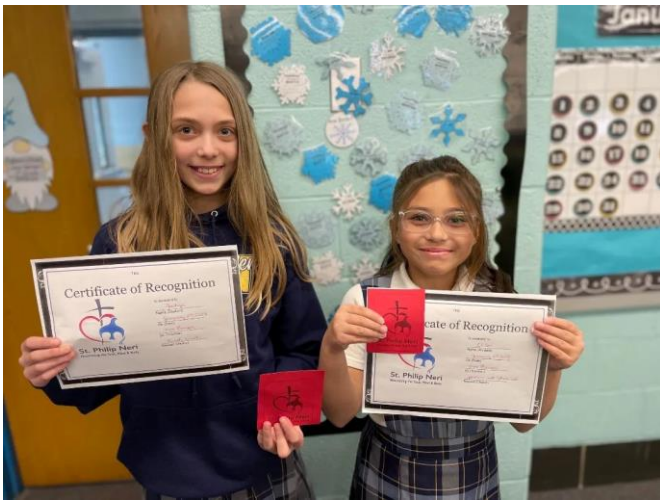
Jester Card Winners