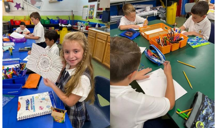
2nd grade enjoyed making symmetrical printmaking projects during art class! (Above)