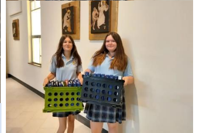
First school-wide Mass for the 2022-2023 school year!