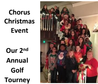
Chorus Christmas Event