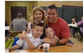
Donuts with Dad