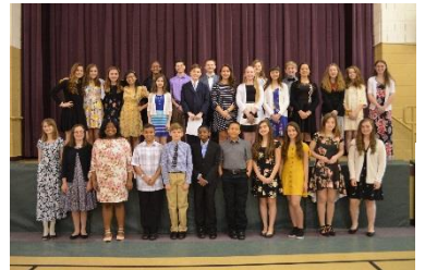
National Junior Honor Society