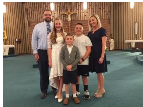
SPN School families welcomed into the church