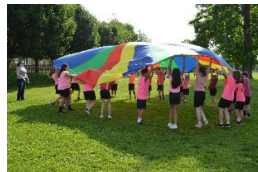
SPN Field Day