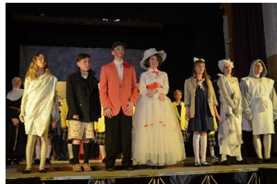
Our 2019 School Musical Mary Poppins, Jr.