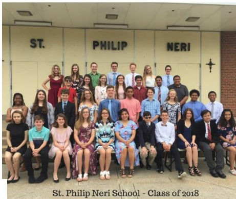
St. Philip Neri School - Class of 2018

We had several gifts made in memory of loved ones. We honor their memory by placing their names below.