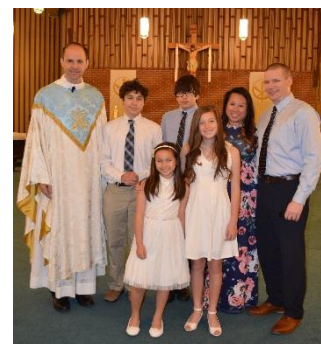
SPN School families welcomed into the church