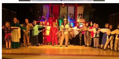
Our 2018 School Musical – Mulan, Jr.