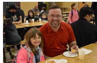
Donuts with Dad