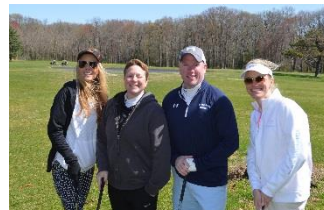
Our 1st Annual Golf Tournament