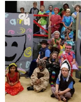
Drama Club Jr.