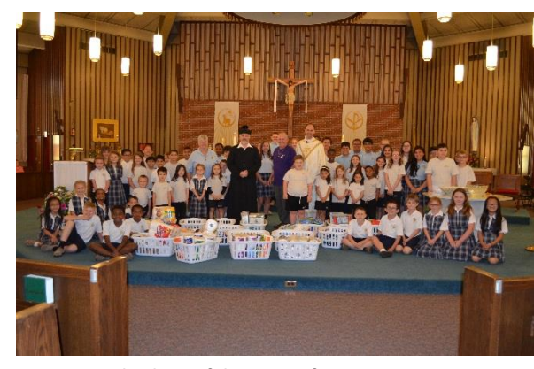
Our baskets of donations for HOPE FOR ALL