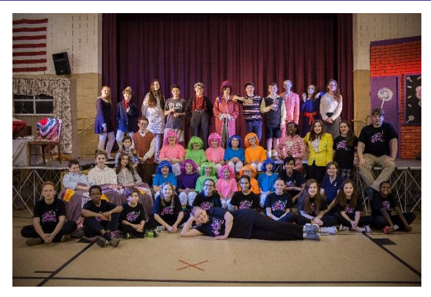
Our 2017 School Musical - Willy Wonka, Jr. What a show!