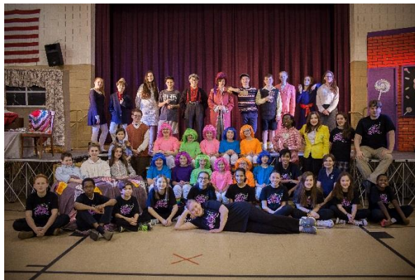
Our 2017 School Musical – Willy Wonka, Jr. What a show!