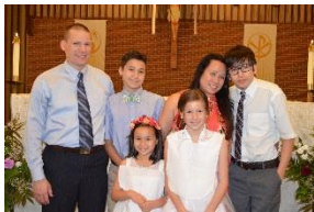
Several students and families received into the church