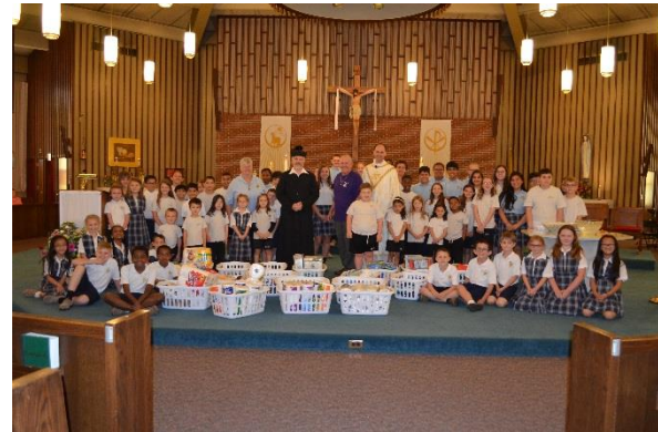
Our baskets of donations for HOPE FOR ALL

We would like to thank all of our donors - those listed on the next page and those that wished to remain anonymous! Your generous support is an outward sign of your support for Catholic school education and for the mission of our school. We are indebted to each of you for your vote of confidence!