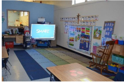
Our PREK Room got an upgrade!