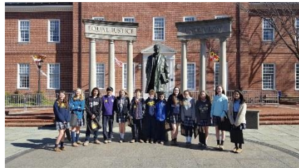
Our students rallied on advocacy day in Annapolis in support of MD Education Credit