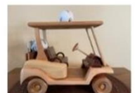
Jim Geiser - Wooden Golf Carts and Display Racks